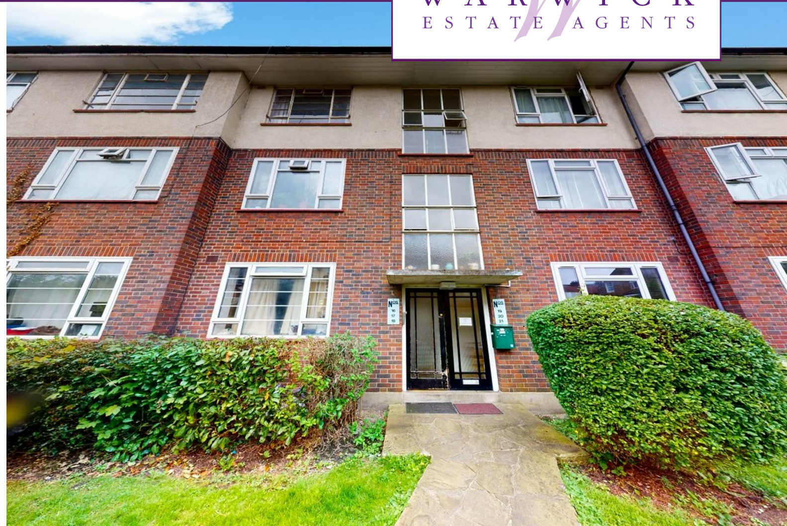
Longstone Avenue, Harlesden, NW10 3RL